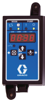
Harrier LT and Harrier